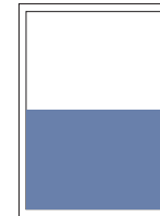
1/2 page horizontal 220×150 mm