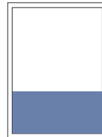
1/3 page horizontal 220×100 mm