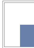
1/4 page vertical 107×150 mm