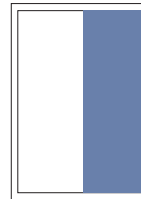
1/2 page vertical 107×310 mm